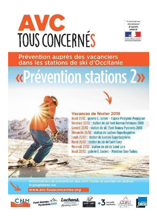
Figure 7. Poster of the AVC Tous concernes in ski resorts, Occitanie 2019.